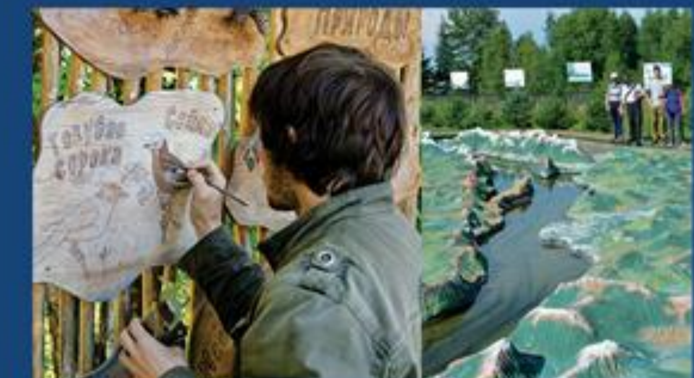
Various environmental education works are done in the Reserve in collaboration with NGOs, museums, universities, colleges, schools of Buryat Republic and Irkutsk Oblast.