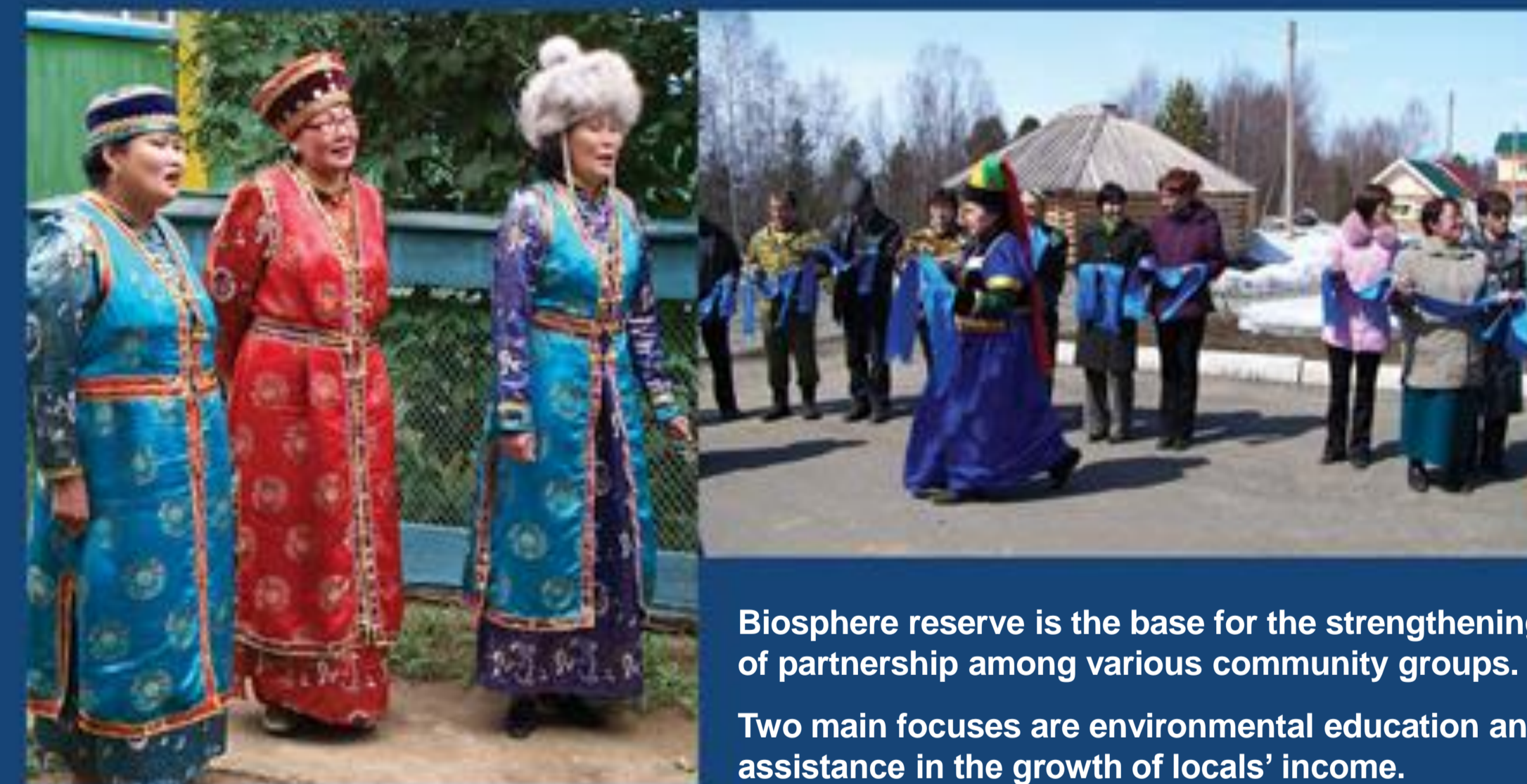
Biosphere reserve is the base for the strengthening of partnership among various community groups. Two main focuses are environmental education and assistance in the growth of locals' income.

There were developed and are used recommendations on the timing and quantity of hunting on animals and birds in the region, of fishing in the Reserve, of berry gathering and pine cones collecting.