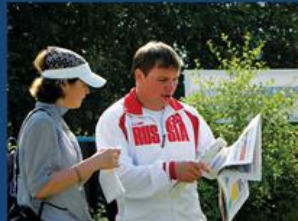
“Plan of management and development of Baikalsky State Nature Biosphere Reserve for 2009-2013” (2008) and “Plan of management and development of Ramsar wetlands of State Nature Zakaznik “Kabansky” (2004) were developed for the management of the Biosphere Reserve.